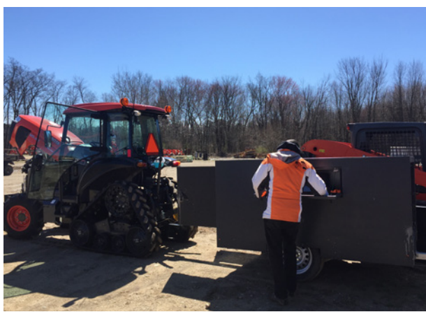
PRUFSTAND A800 in action