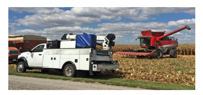
PRUFSTAND® can be adapted to fit into service vehicles

saving benefits for troubleshooting alone. PRUFSTAND® comes in the A400hp and A800hp trailer versions, but can be adapted to fit into a service vehicle - remember it's 100% independent! It can also be linked together with other Dynos in the family for greater hp testing. We call this DYNOLink®.